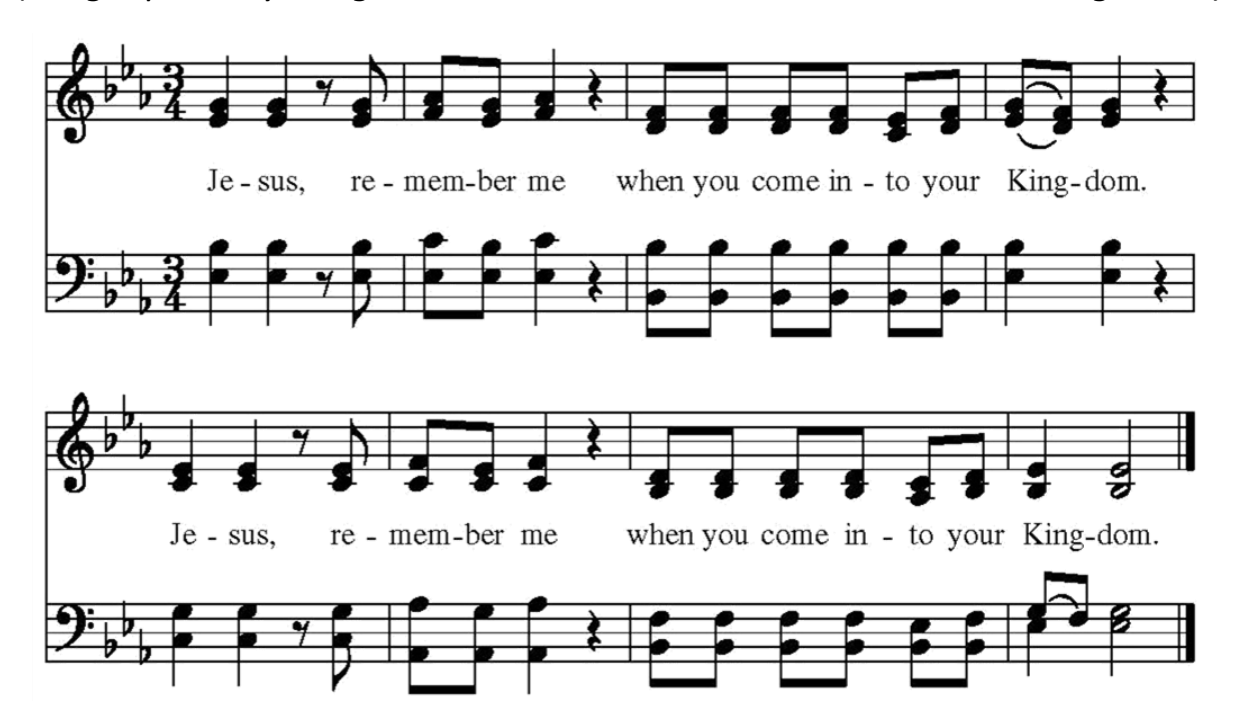
Depart in silence

(Sung repeatedly as lights are lowered and until Christ candle is extinguished)